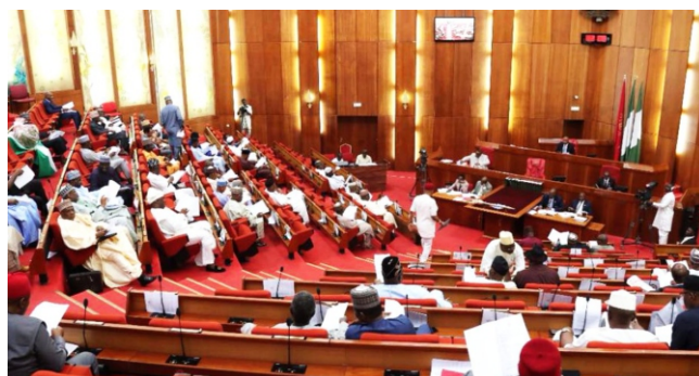
Senate Chambers, Nigerian National Assembly

Attorney-General of the Federation and Minister of Justice, Abubakar Malami, SAN said the Federal Government is working round the clock to ensure that Nigerian legal system reflects nation's existence in view of dynamism and contemporary realities.