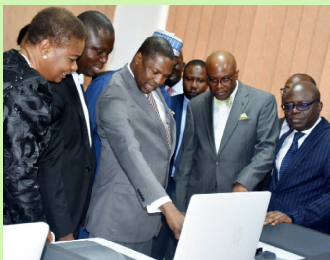
Malami inspecting the facilities at the National Depository of Treaties Complex , Federal Ministry of Justice, Abuja

Acting in compliance with the extant laws including the provisions of Economic and Financial Crimes Commission (EFCC) Establishment Act 2004, the Attorney General of the Federation and Minister of Justice, Abubakar Malami, SAN set up and inaugurated the Inter-Ministerial Asset Disposal Committee. membership of the committee cut across various ministries, departments and agencies aimed at achieving an-all-inclusive comprehensive, consolidated and robust implementation of mandate of the committee.